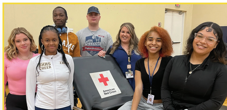
SOS Students at the High School learn how to assist during a blood drive with the American Red Cross recently.